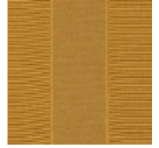
1679-07 FONTENAY - AMBRE