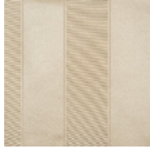
1679-03 FONTENAY - PLATINE *