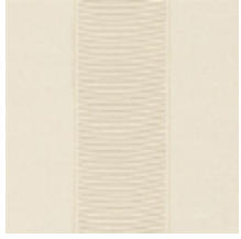
1679-01 FONTENAY - ALBATRE