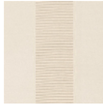
1679-12 FONTENAY - RAMIER