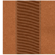
1679-14 FONTENAY - MACARON