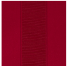
1679-09 FONTENAY - RUBIS