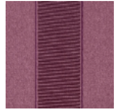
1679-15 FONTENAY - AMETHYSTE