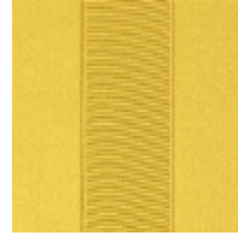
1679-06 FONTENAY - BOUTON D'OR