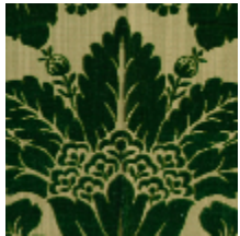
1681-01 MANSART - VERT