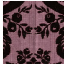
1681-05 MANSART - AMETHYSTE