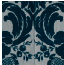
1681-03 MANSART - BLEU