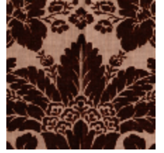
1681-06 MANSART - CHATAIN