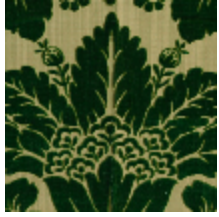
1681-01 MANSART - VERT