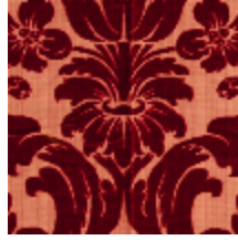
1681-04 MANSART - RUBIS