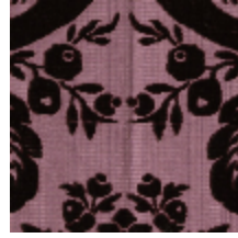
1681-05 MANSART - AMETHYSTE