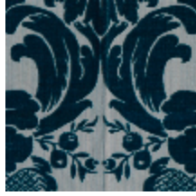
1681-03 MANSART - BLEU