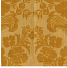
1681-02 MANSART - OR