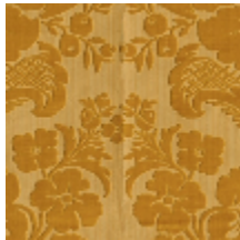
1681-02 MANSART - OR