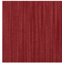
1682-04 VERTIGE - TOURMALINE