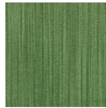
1682-20 VERTIGE - MYRTE