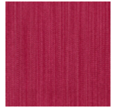
1682-07 VERTIGE - ROSE ANCIEN