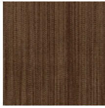
1682-03 VERTIGE - BOIS