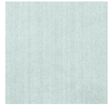
1682-22 VERTIGE - PASTEL