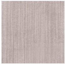
1682-16 VERTIGE - FUMEE *