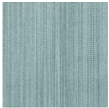
1682-23 VERTIGE - SAUGE