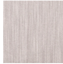
1682-14 VERTIGE - PERLE