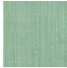
1682-21 VERTIGE - AMANDE *