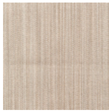
1682-17 VERTIGE - SEIGLE