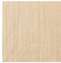
1682-12 VERTIGE - BLOND