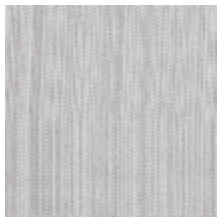
1682-15 VERTIGE - ARGENT