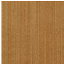
1682-10 VERTIGE - ECAILLE *