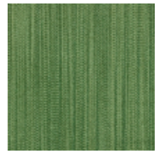
1682-20 VERTIGE - MYRTE