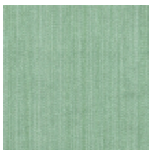
1682-21 VERTIGE - AMANDE