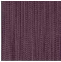
1682-02 VERTIGE - AMETHYSTE