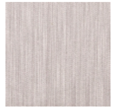
1682-14 VERTIGE - PERLE