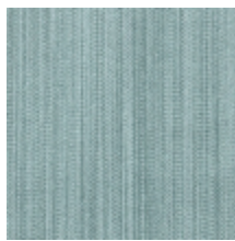
1682-23 VERTIGE - SAUGE