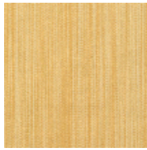
1682-11 VERTIGE - OR