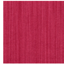
1682-05 VERTIGE - ECARLATE