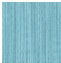
1682-24 VERTIGE - NATTIER