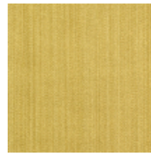
1682-19 VERTIGE - CHARTREUSE