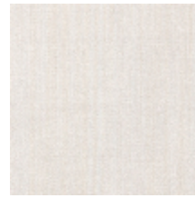
1682-13 VERTIGE - CAMELIA