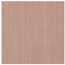
1682-09 VERTIGE - POUDRE