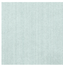
1682-22 VERTIGE - PASTEL