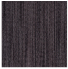
1682-01 VERTIGE - ARDOISE