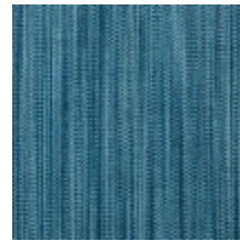
1682-25 VERTIGE - SAPHIR