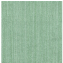
1682-21 VERTIGE - AMANDE