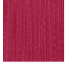
1682-07 VERTIGE - ROSE ANCIEN