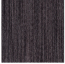
1682-01 VERTIGE - ARDOISE