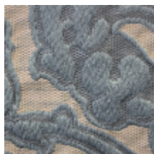
1691-01 LEONARDO - NATTIER