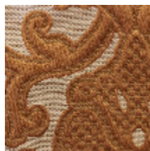
1691-04 LEONARDO - ECAILLE