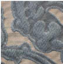
1691-01 LEONARDO - NATTIER