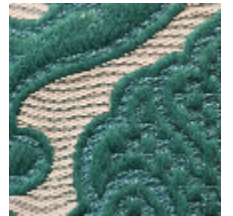
1691-06 LEONARDO - MYRTHE