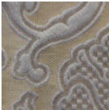
1691-02 LEONARDO - EMAIL