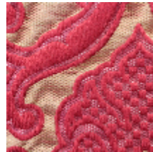
1691-05 LEONARDO - RUBIS