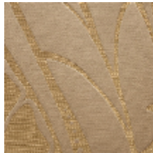
1694-03 VITRAIL - DORE