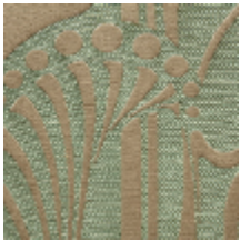
1694-01 VITRAIL - OPALINE