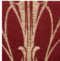
1694-04 VITRAIL - LAQUE