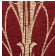
1694-04 VITRAIL - LAQUE