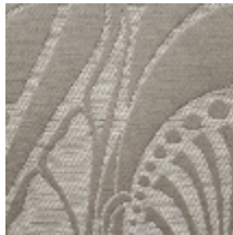
1694-02 VITRAIL - CHRYSLER