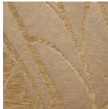
1694-03 VITRAIL - DORE