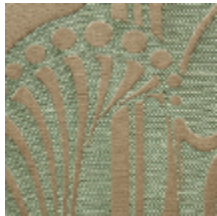
1694-01 VITRAIL - OPALINE