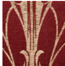
1694-04 VITRAIL - LAQUE