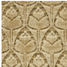
1695-02 TULIPES - OR