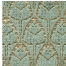
1695-04 TULIPES - JADE