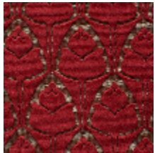
1695-01 TULIPES - CORNALINE