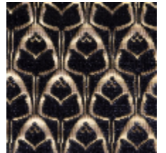
1695-06 TULIPES - ORAGE