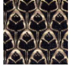
1695-06 TULIPES - ORAGE