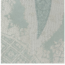
1697-01 PERSIENNE - OPALE