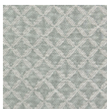
1699-01 GUIPURE - OPALE