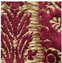
1701-01 CAMMINO - RUBIS