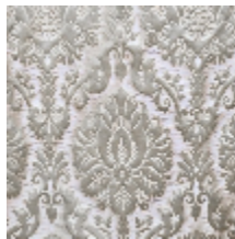
1701-03 CAMMINO - ARGENT