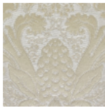
1703-03 MONCEAU - CHAMPAGNE