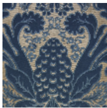
1703-02 MONCEAU - BLEU