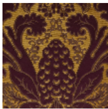
1703-01 MONCEAU - PRUNE