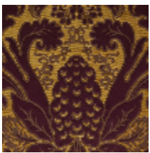
1703-01 MONCEAU - PRUNE