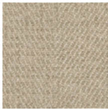
3213-02 FIGUIER - LIN