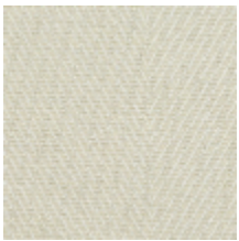
3213-01 FIGUIER - ECRU