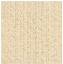
3217-01 HEVEA - GRES