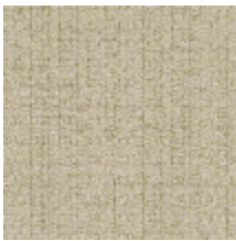
3217-02 HEVEA - FICELLE