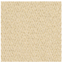
3218-01 EPICEA - GRES