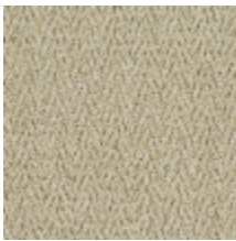
3218-02 EPICEA - FICELLE