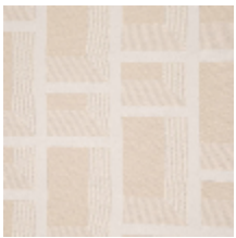
3227-01 DISTRICT M1 - NATUREL