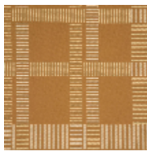
3230-02 SQUARE M1 - CAMEL