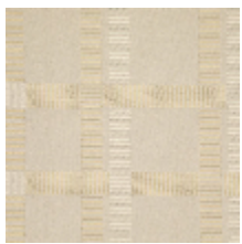
3230-01 SQUARE M1 - NATUREL