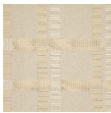
3230-01 SQUARE M1 - NATUREL