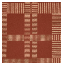
3230-04 SQUARE M1 - BRIQUE