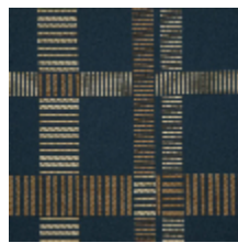
3230-03 SQUARE M1 - MARINE