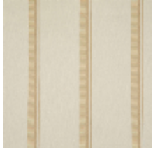
3251-01 ACACIA - NATUREL