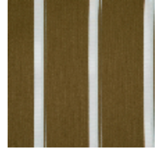
3251-07 ACACIA - BRONZE