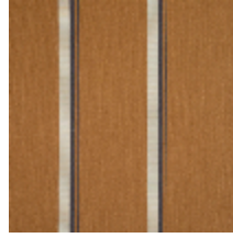
3251-04 ACACIA - GAZELLE