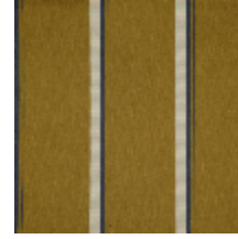
3251-06 ACACIA - GENTIANE