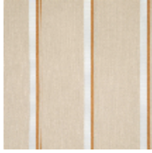
3251-02 ACACIA - FICELLE