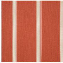
3251-09 ACACIA - PAPRIKA