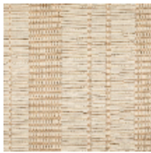
3263-02 SILLONS - ECRU