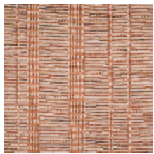
3263-01 SILLONS - TERRACOTTA