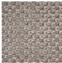
3264-03 NOMADE - GRIS BLEU