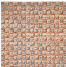
3264-01 NOMADE - TERACOTTA