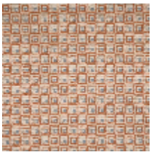
3264-01 NOMADE - TERACOTTA