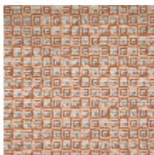
3264-01 NOMADE - TERACOTTA