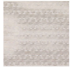
3268-06 LES CRAIES - RECTANGLE