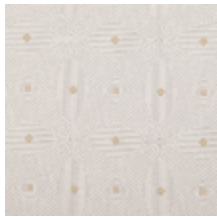
3268-07 LES CRAIES - BIG DEDALE