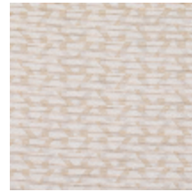
3268-05 LES CRAIES - DELTA