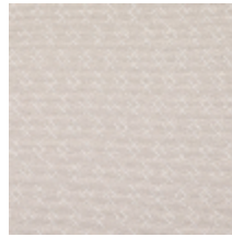
3268-04 LES CRAIES - AXIS