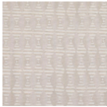
3268-01 LES CRAIES - BIG LOSANGE