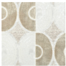
3280-01 EQUINOX - NATUREL