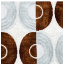
3280-02 EQUINOX - ALEZAN