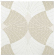
3282-01 FLABELLA - NATUREL