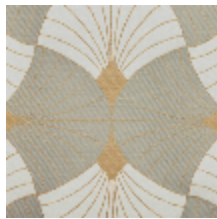
3282-03 FLABELLA - VERT DE GRIS