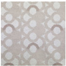
3283-01 MAELSTROM - NACRE