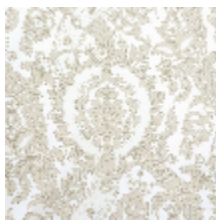
3284-02 LES INDES - NATUREL