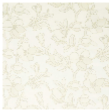
3285-01 SAYURI - NATUREL