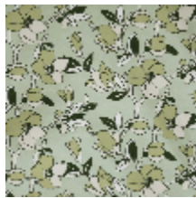
3285-03 SAYURI - SAUGE