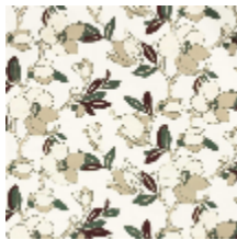
3285-02 SAYURI - PRUNE