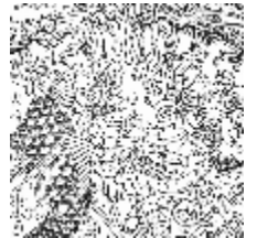
3303-06 HORIMONO - NOIR