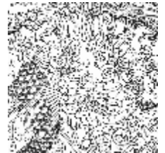
3303-06 HORIMONO - NOIR