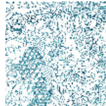
3303-05 HORIMONO - CANARD