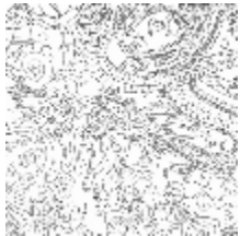
3303-01 HORIMONO - ARGENT