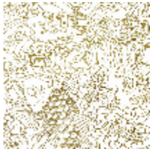
3303-02 HORIMONO - OR