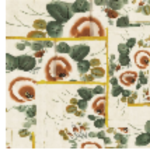
3317-04 ANASTASIA - DORE *