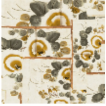
3317-01 ANASTASIA - NATUREL *