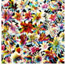
3339-01 GRENADA - MULTICO