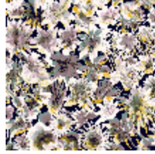
3339-03 GRENADA - PASTEL