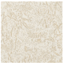
3410-01 AFRIKA - NATUREL