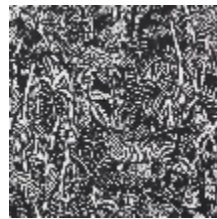
3410-05 AFRIKA - NOIR