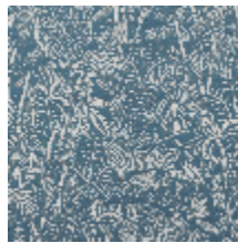
3410-04 AFRIKA - AZUR