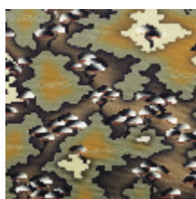
3416-01 MESAI - KAKI