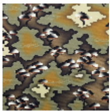
3416-01 MESAĪ - KAKI