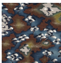
3416-02 MESAI - FAUVE