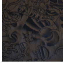
3433-03 KOMODO - NUIT *