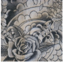
3433-01 KOMODO - GRAPHITE