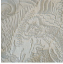
3433-02 KOMODO - BEIGE