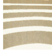
3434-06 ILLUSION - BEIGE *