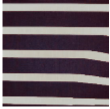
3434-02 ILLUSION - NECTAR *