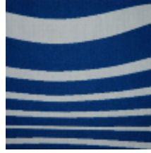
3434-05 ILLUSION - MARIN *