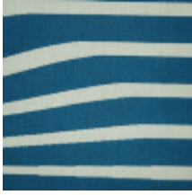
3434-03 ILLUSION - BALTIQUE *