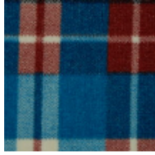
3435-03 KILT - BENGALE