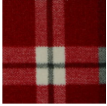
3435-01 KILT - NECTAR