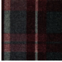
3435-02 KILT - BORDEAUX *