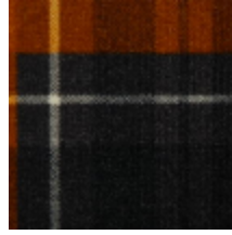
3435-04 KILT - GOLD