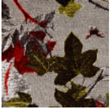
3437-01 MOUSSON - NECTAR