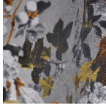
3437-03 MOUSSON - GOLD