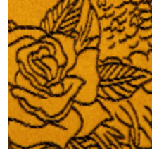
3440-06 SKIN - GOLD