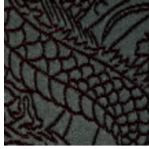
3440-03 SKIN - NECTAR